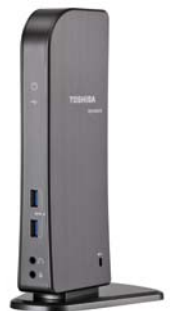
Steel Grey Metallic PA3927E-2PRP