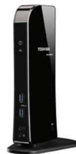
Glossy Black PA3927E-1PRP